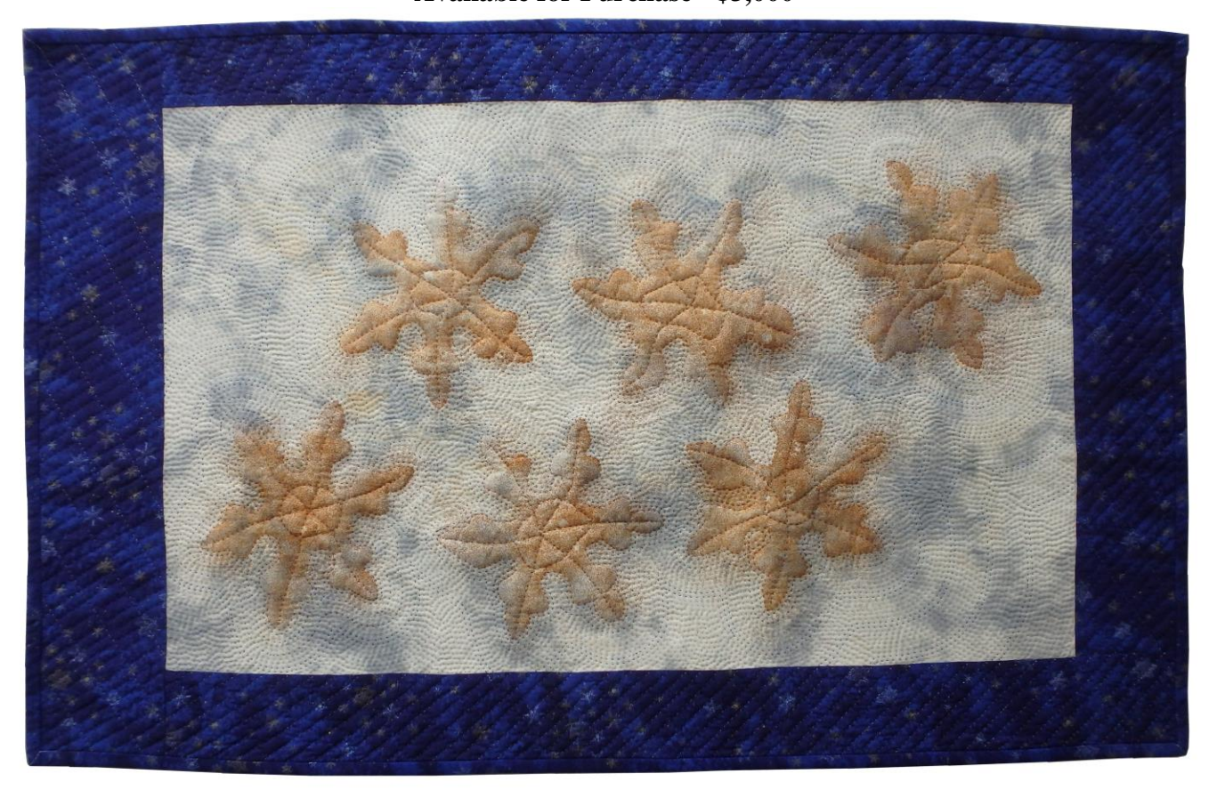
Exhibition and Publication History